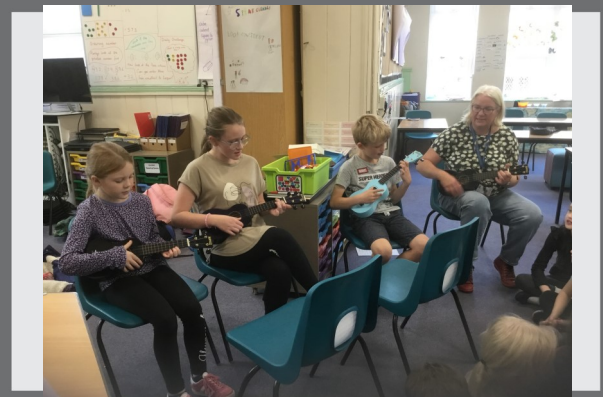
Ukulele club perform in celebration assembly